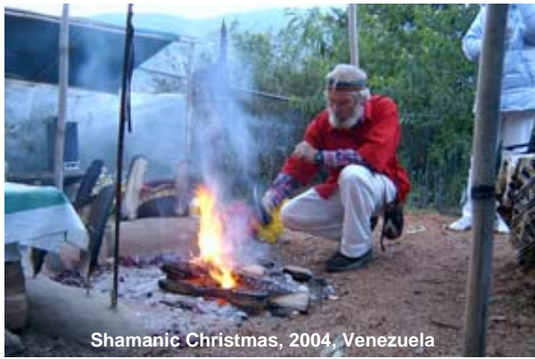
Shamanic Christmas, 2004, Venezuela

herent and natural healing potency (" The Doctor Within "). For this, we make use of the shamanic methods transmitted since immemorial times as a universal strategy of the whole humanity for the acquisition of personal and collective knowledge, strength and health. The South American lineage of Indian Shamanism distinguishes itself mainly of an imposing abundance of very extraordinary healing plants. Among them we also find the particularly called " Sacred Power Plants ", as for example the San Pedro cactus (botanical name: Trichocereus Pacchanoi ) of the Andean mountains and – among many others – the Ayahuasca vine (botanical name: Banisteriopsis Caapi ) of the tropical forests of the Amazon basin. To them we owe the activation and energetic transformation of our lucid every day's consciousness and of our accustomed