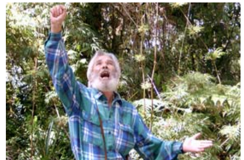
Shamanic Power Walk, Venezuela

"There the spirit rises over the body and meets with the totality, there I was pure and converted into entirely clear energy, – and today I know that it was that moment, in which I was cured". (Comment from an Austrian participant)